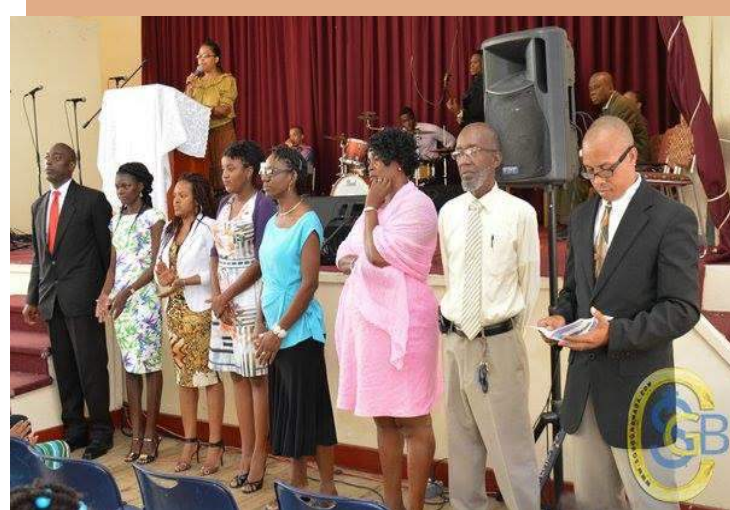
Members of the Grenada Baptist Association