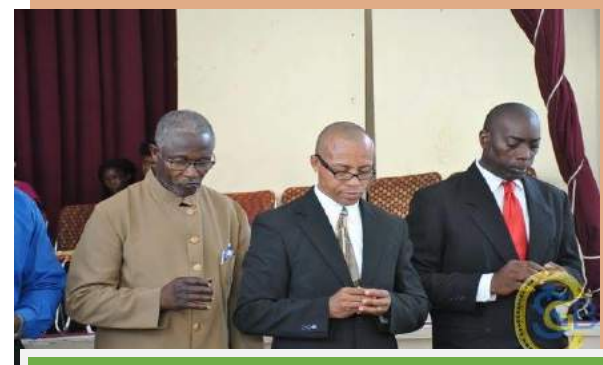
Pastors from the Grenada Baptist Association