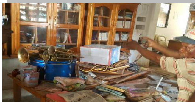
Damage By Hurricane Matthew in Haiti at one of the Missionary Evangelical Baptist Churches.

A visit was made by the EST to Haiti at the instance of the Baptist World Alliance, to conduct an assessment of the damage done and to recommend the channel through which relief was to be sent. Based