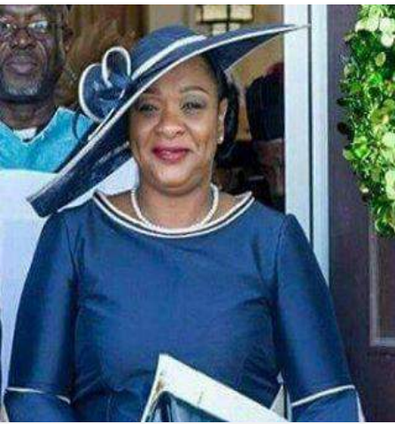
Hon. Sharlene Cartwright-Robinson