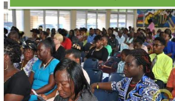
Members of Grenada Baptist Association